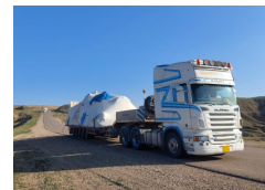
Transloading in north of Iraq