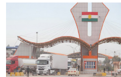
Ibrahim Khalil border (Türkiye-Iraq)